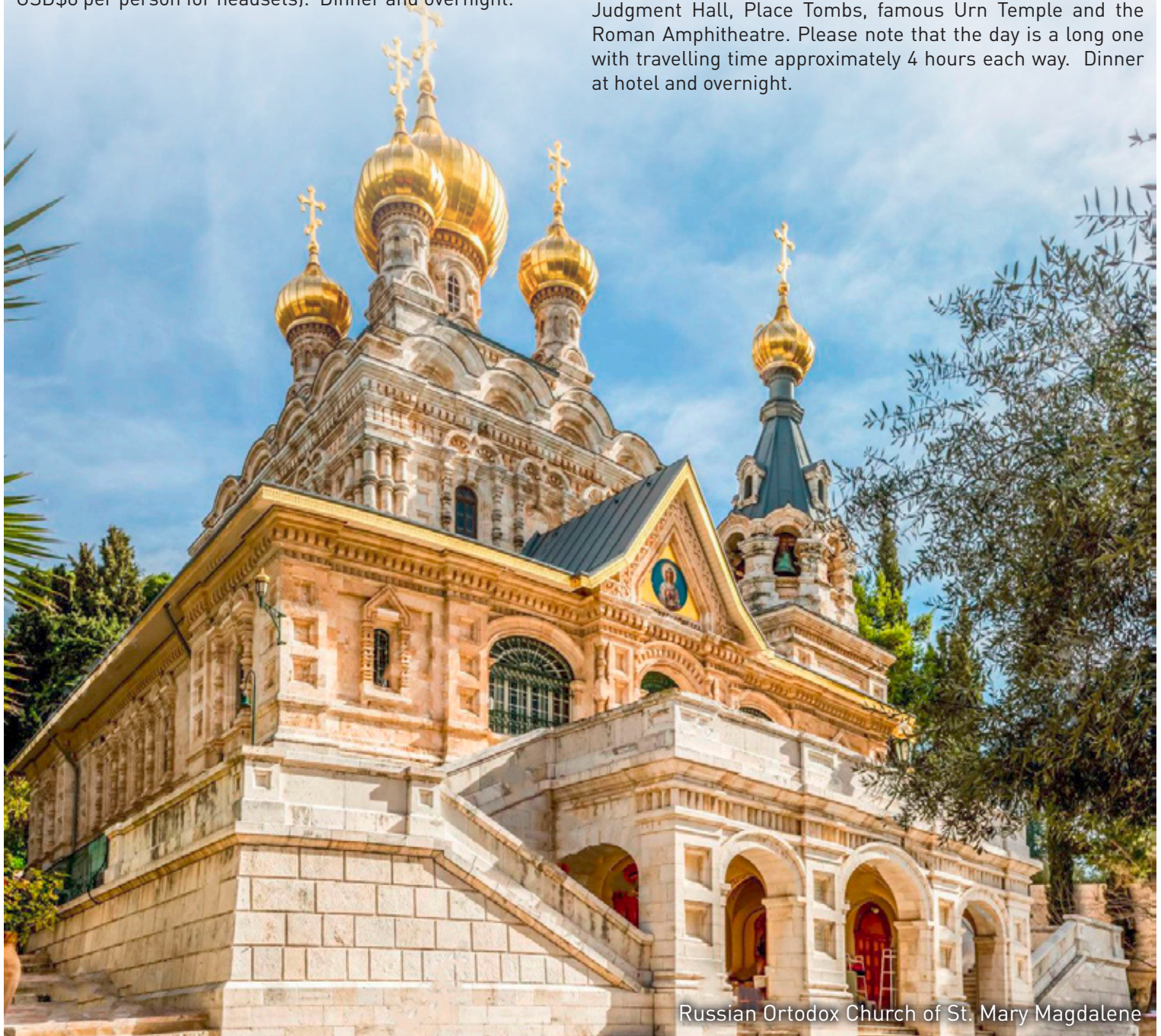
Russian Orthodox Church of St. Mary Magdalene

2. For those people doing the optional day tour to Petra . You will visit this ancient Edomite and Nabatean capital which is an amazing city of prophecy. See this spectacular “City of the Dead” with its famed gorge, Ancient Street, temples, dwelling places and tombs carved from the solid rock. Arrive at El Ji Post and continue the one-mile journey on horseback, or walk, passing through the famous SIQ (natural gorge) and arrive at the “Treasury” . Visit the ancient theatre in the Nabataea Judgment Hall, Place Tombs, famous Urn Temple and the Roman Amphitheatre. Please note that the day is a long one with travelling time approximately 4 hours each way. Dinner at hotel and overnight.